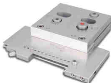
WST vise installed on 3 axis leveling base